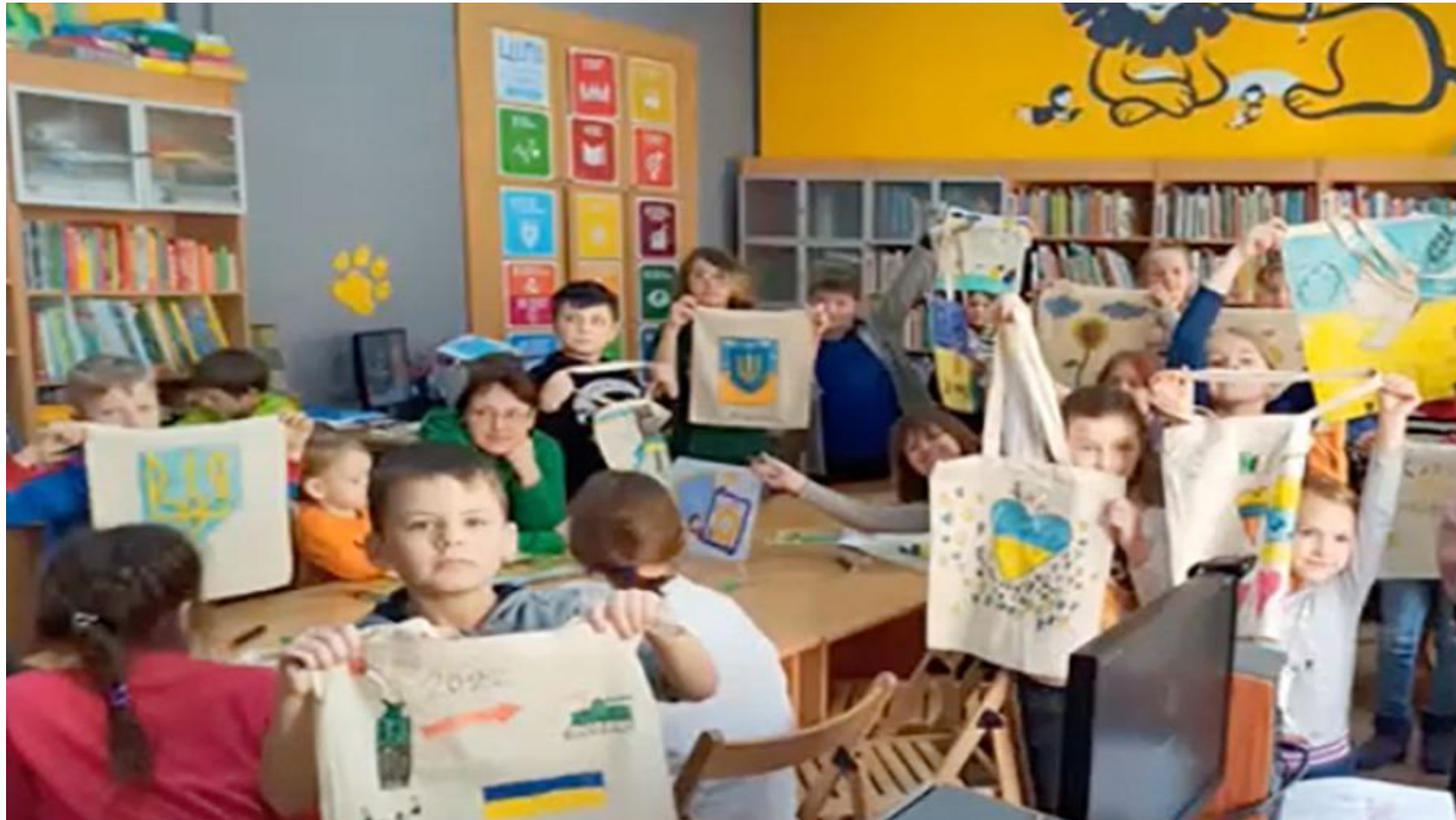
Lviv Regional Library for Children, Ukraine (Zoom)